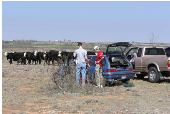
The restless cows