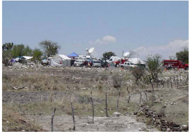
The media trucks at the recovery base camp. "It was difficult changing clothes, there were so many cameras and reporters around."