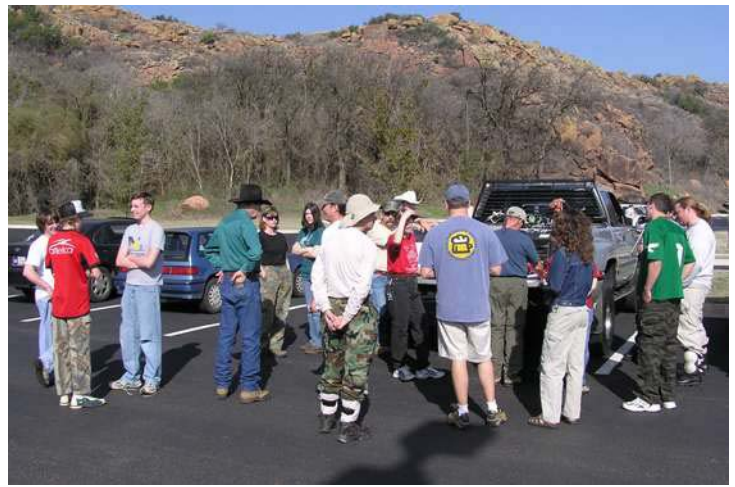
Waiting to go caving

time. Obviously they were accustomed to being fed hay when trucks pulled into their pasture, and that was something we'd forgotten to bring on this trip.