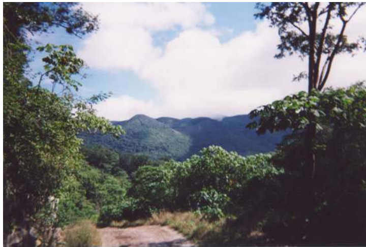
Lalaja, San Louis Potosi, Mexico, 11/25/02 This is the mountainous terrain between Lalaja and Paxalja, with many closed valleys.

Saturday morning came and everyone was packing up