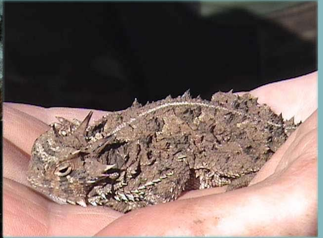
Jester Cave, OK